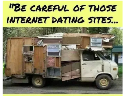
...HIS PROFILE SAID HE TRAVELS A LOT AND ALSO OWNS HIS OWN HOME!"

You never appreciate what you have till it's gone. Toilet paper is a good example.